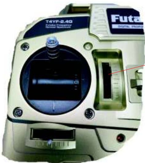
Left-hand joystick with Horizontal trim three quarters up